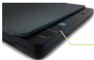
One-Touch Scan Button

A fast scan button is a smart button which enables users to start a scanning process immediately by touching a button. Set up by software, a fast smart button can fast and easily carry out functions such as scanning, printing, OCR and emailing, enhancing work efficiency and meeting with customers' needs.