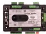
ComAp IntelliGen BaseBox