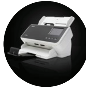
Alaris S2060w/S2080w Scanners