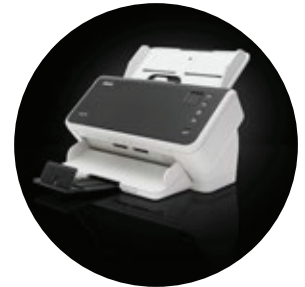
Alaris S2050/S2070 Scanners