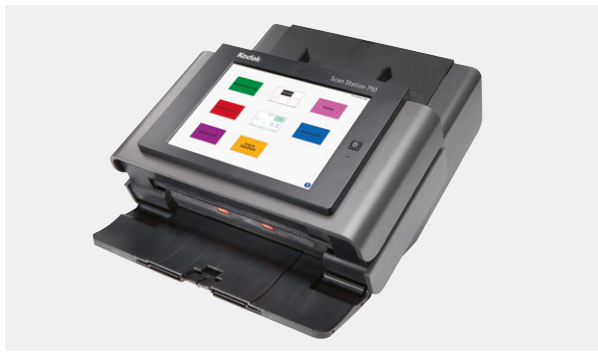
Robust build and quality