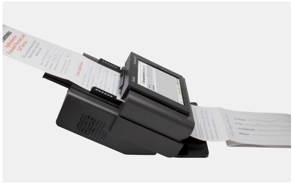
Improved paper handling