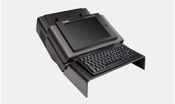
Shown with optional Kodak Scan Station Keyboard and Stand Accessory

Get the best possible performance from your scanners and software with a full range of Service and Support contracts available to protect your investment and keep productivity at peak levels. The worry-free warranty puts Kodak Alaris knowledge to work for you, helping your Kodak Scan Station 710 Scanners satisfy your changing business process needs for years to come.